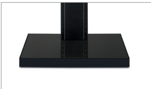
concealed castors, high-gloss surface